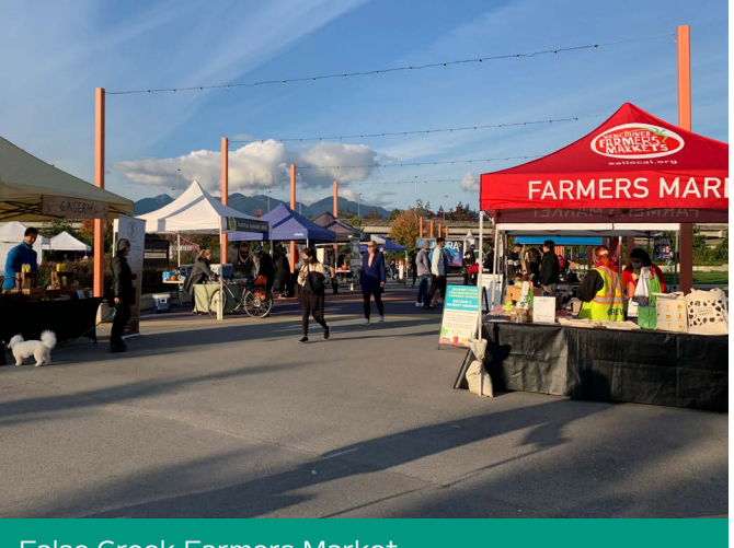
False Creek Farmers Market

We are grateful to our partners, the City of Vancouver and Vancouver Parks Board, for their commitment to helping this location find a new home, as there is high demand for the market by the False Creek and Olympic Village communities and we are confident that it will continue to grow. We are also grateful to Concord Pacific for supporting this market again in 2022.