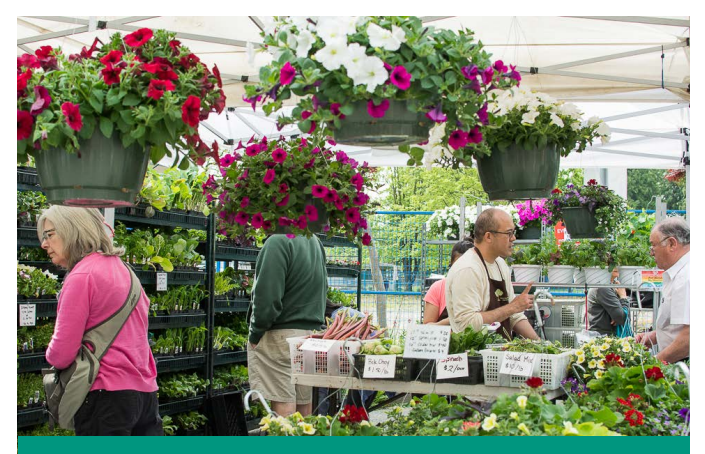
Riley Park Farmers Market

We are grateful to the Vancouver Canadians, the Vancouver Parks Board and City of Vancouver for their commitment to ensuring the continuity of our markets at Riley Park during the summer and winter seasons.