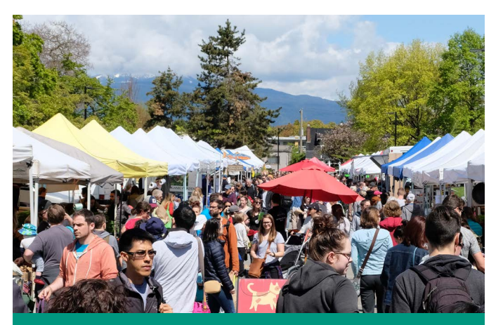
Kitsilano Farmers Market

We are grateful to the Vancouver Parks Board for their ongoing support for our market at this location.