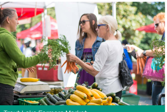
Trout Lake Farmers Market

We are grateful to the City of Vancouver and the Vancouver Parks Board for their ongoing support for our market at this location.