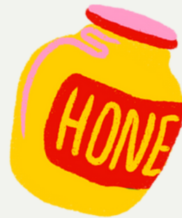
Downtown Farmers Market