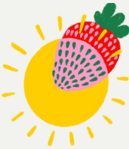
Kitsilano Farmers Market