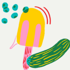
West End Farmers Market