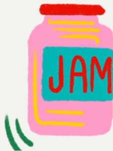
False Creek Farmers Market