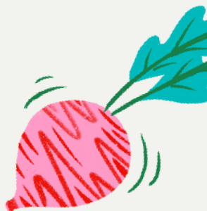
Hastings Park Winter Farmers Market