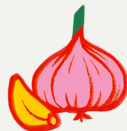
Riley Park Winter Farmers Market