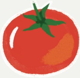
Trout Lake Farmers Market