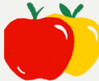
Mount Pleasant Farmers Market