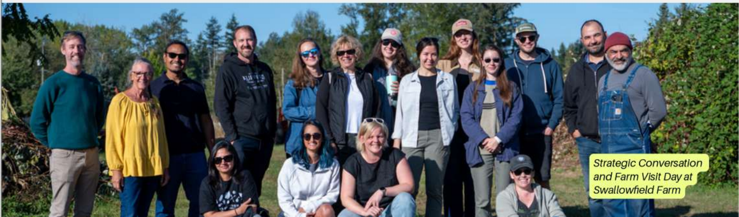
Strategic Conversation and Farm Visit Day at Swallowfield Farm

We create vibrant and welcoming markets that build community, feed people, and support small farms and producers.